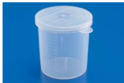
13000 Series 5 oz. Graduated Containers