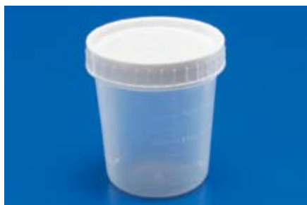
17000 Series 4oz. Graduated Containers