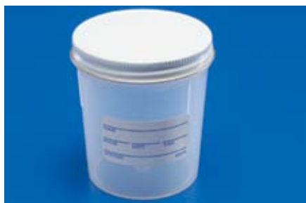
14000 Series 6 oz. Graduated Containers