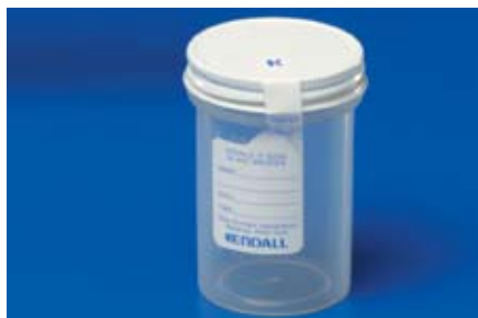
19000 3.5 oz. Graduated Containers