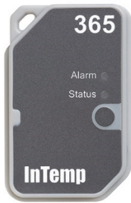
(CX503 model shown)

InTemp CX500 series loggers measure temperature in transportation monitoring applications. These Bluetooth® Low Energy-enabled loggers are designed for wireless communication with a mobile device and can be configured to monitor temperatures in Cold Chain, CRT, and Frozen shipments. CX500 series loggers, the InTemp app, and InTempConnect® web-based software work together to form the InTemp temperature monitoring solution. Using the InTemp app on your phone or tablet, you can configure CX series loggers and then download them to share and view logger reports, which include logged data, excursions, and alarm information. Or, you can use InTempConnect to configure and download CX series loggers via the CX5000 Gateway. Once logged data is uploaded to InTempConnect, you can view logger configurations, build custom reports, monitor trip information, and more. The CX500 series logger is available in a single-use 90-day model (CX502) or a multiple-use 365-day model (CX503).