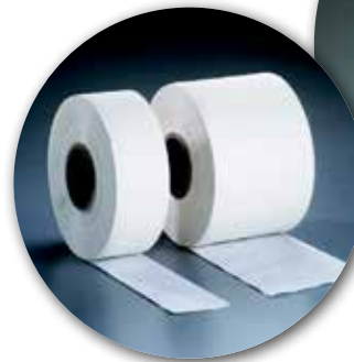
Custom Size Zorb Sheets

*Custom sizes and imprints are available. Call for a quote.