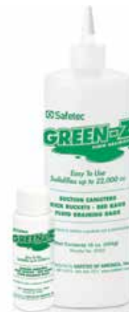
42005 & 42003 Green-Z® Can-Z® Bottles Shown