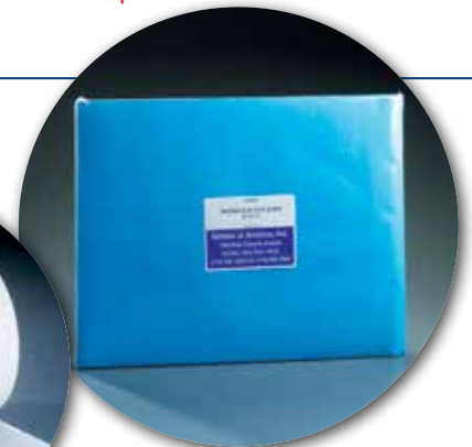
Super Barrier Zorb Sheets