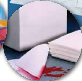
Zorb Sheets for Lab Spills