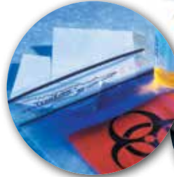
Zorb for Bio-Hazard Kits

*Custom sizes and imprints are available. Call for a quote.