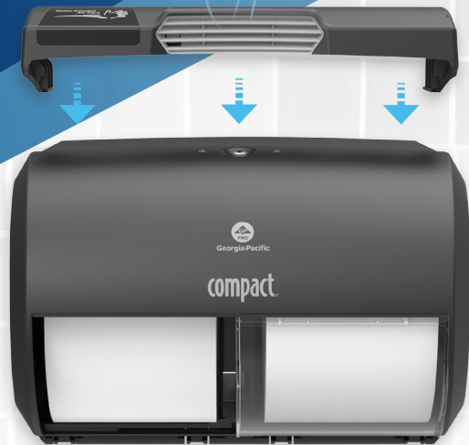
Compact® Side-By-Side Bathroom Tissue Dispenser with ActiveAire® Freshener Dispenser