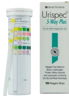
URISPEC® 5-Way Plus