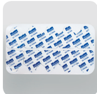
Disposable EZ-Trode ECG Electrodes 2-100-0205 (Box of 500) 2-100-0206 (10 boxes of 500)