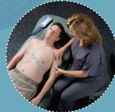
An easy-to-use, 12-lead, digital ECG that helps to quickly administer testing.