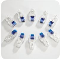
Clear ECG Clips (4mm & Snap) 3-047-0005