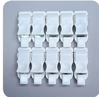
Universal ECG Clips (3mm, 4mm & Snap) 3-047-0001