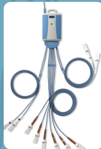
Lightweight, portable design, weighing less than 11 oz.