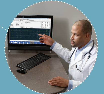
Review and edit ECG results on-screen.