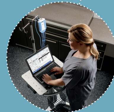
Lightweight, portable design makes moving from room to room quick and easy.