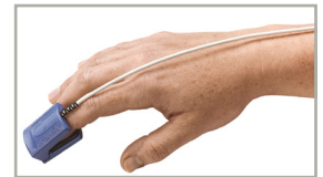
Adult Clip Sensor