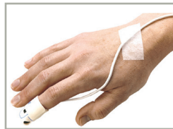
Adult Flex System