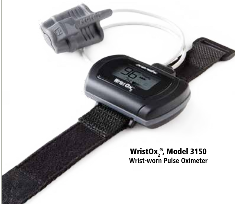
WristOx 2 ® , Model 3150 Wrist-worn Pulse Oximeter

The WristOx 2 , Model 3150 with MVI mode provides a graphic display of the amount of recorded data in hours and minutes. MVI mode provides assurance that sufficient data has been recorded; preventing unnecessary trips for repeat recordings, reducing costs, and improving overall efficiencies.