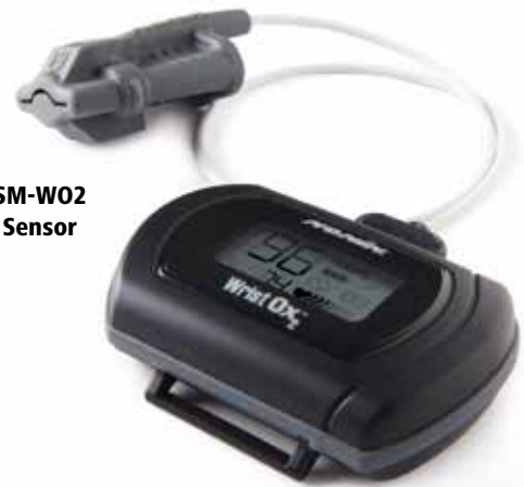
8000SM-WO2 Soft Sensor