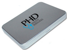
Packaged in metal storage case!