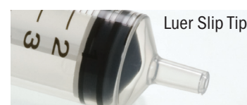
Luer Slip Tip