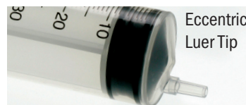
Eccentric Luer Tip