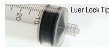
Luer Lock Tip