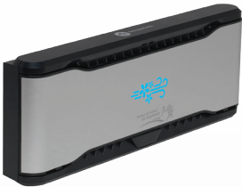
ActiveAire® Automated In-Install Freshener Dispenser, Stainless Finish