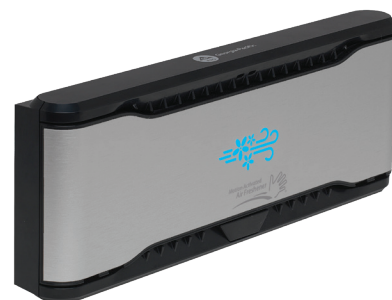
ActiveAire® Automated In-Install Freshener Dispenser