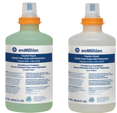
enMotion® Counter Mount Soap Refills