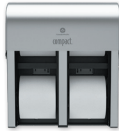
Compact Quad® Four Roll Coreless Toilet Paper Dispenser