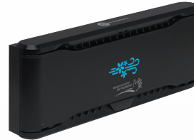
ActiveAire® Automated In-Install Freshener Dispenser, Black