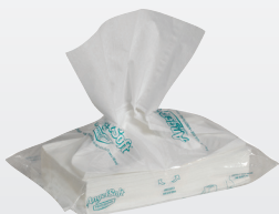
Angel Soft Professional Series® PolyFlex™ Facial Tissue