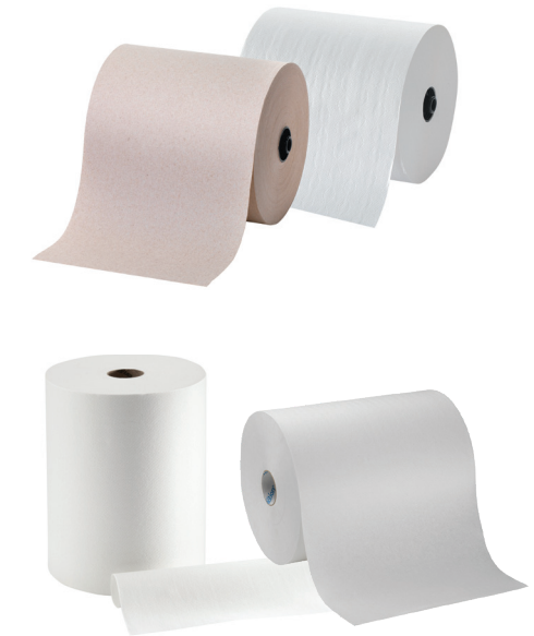
enMotion® Paper Towel Refills