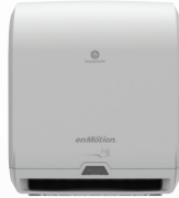
enMotion® 10" Paper Towel Dispenser