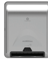
enMotion® Recessed Automated Touchless Paper Towel Dispenser