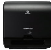
enMotion® Flex Mini Automated Touchless Paper Towel Dispenser