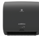
enMotion® Impulse® 8" Paper Towel Dispenser