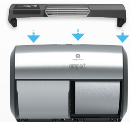
ActiveAire® Automated Freshener Dispenser shown with the Compact® Side-By-Side Toilet Paper Dispenser