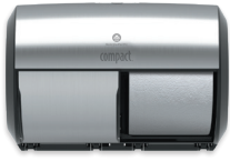
Compact® Side-By-Side Double Roll Toilet Paper Dispenser