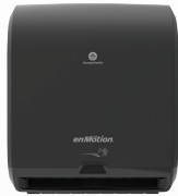
enMotion® 10" Paper Towel Dispenser