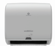
enMotion® Impulse® 8" Paper Towel Dispenser