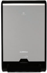
enMotion® Flex Recessed Automated Touchless Paper Towel Dispenser