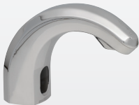
enMotion® Automated Touchless Counter Mount Soap Dispenser

*Ask about our 100% Recyclable bottled soap and sanitizer refills