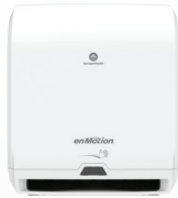
enMotion® 10" Paper Towel Dispenser