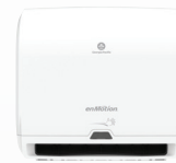
enMotion® Impulse® 8" Paper Towel Dispenser