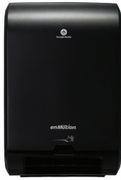
enMotion® Flex Automated Touchless Paper Towel Dispenser