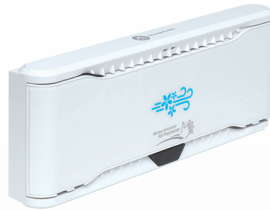
ActiveAire® Automated In-Install Freshener Dispenser, White