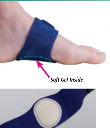
Covered gel pad

Specify Small (fits narrow and average width feet) or Large (fits wide feet) 1/package. Item P1291