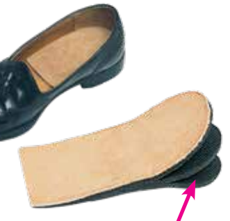
Use "as is" for a 3/8″ elevation or simply peel off individual 1/8″ layers to get your desired thickness.