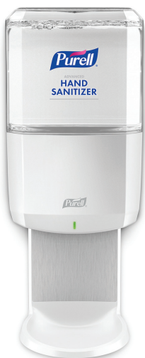
PURELL ES6 Reliable, touch-free dispensing for soap or sanitizer