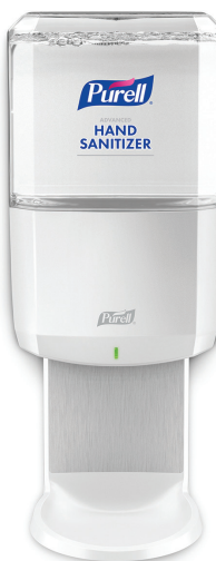
PURELL ES8 Reliable, touch-free dispensing for soap or sanitizer