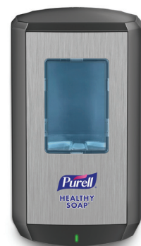
PURELL CS6 Reliable, touch-free dispensing for soap