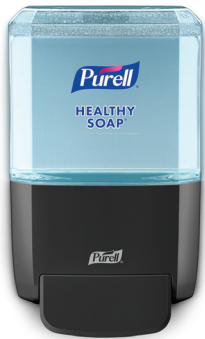
PURELL ES4 Durable, push-style dispensing for soap or sanitizer

In even the most demanding environments, PURELL® dispensing systems are designed for reliability. From the production floor to the front office, GOJO can equip your facility with the reliable and attractive soap and sanitizer dispensers you need to stay up and running.