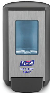
PURELL CS4 Durable, push-style dispensing for soap