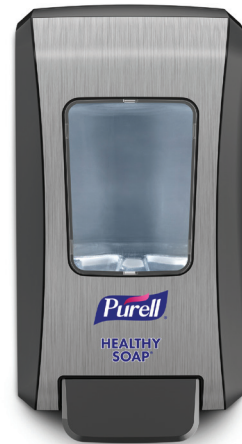
PURELL FMX-20™ High-capacity, push-style dispensing for soap