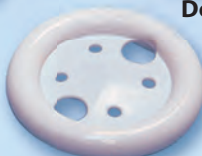
Ring (with support)

Premier® Medical Products www.premusa.com