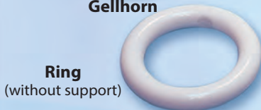
Ring (without support)