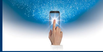
Openness to Innovation and Change