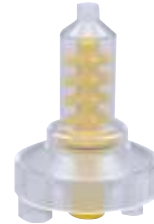
Dynamic Mixing Tips