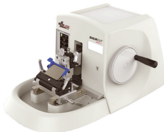
(217-0219) SHURCut™ Artis A Automated Microtome