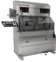
Elevating Gross (126-0739)