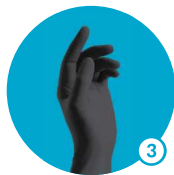
Nitrile Exam N200 & N300 Gloves