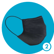
Earloop Masks Levels 1 & 3