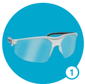
Temple Grip Protective Eyewear